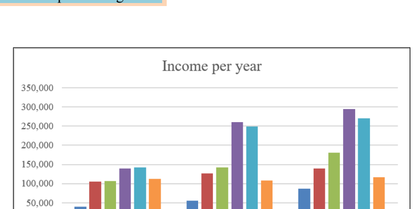
Figure 1 Income per year of Bangkok elderly (Thailand National Statistic Organization, 2007, 2014, 2018)